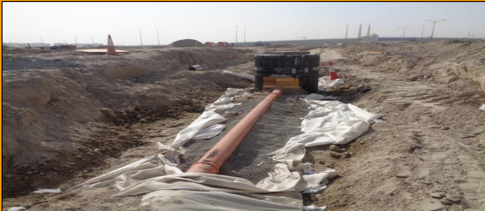
Storm Water Drainage Works