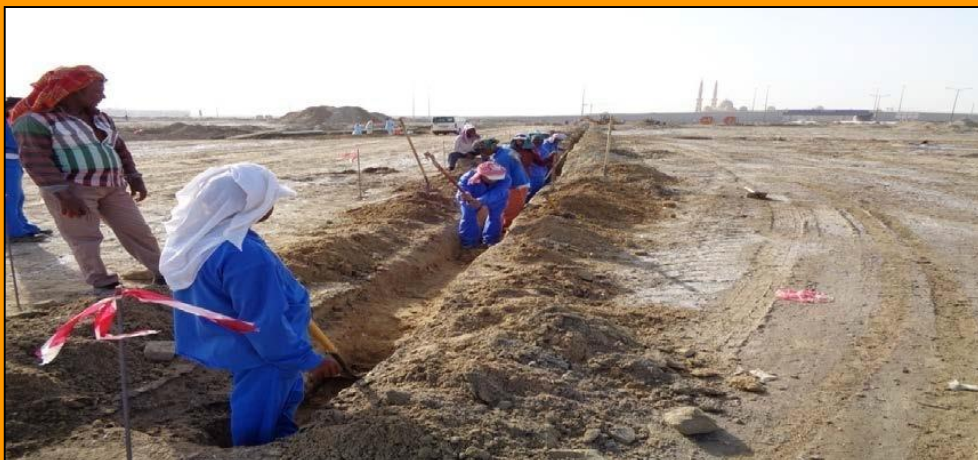
Street Lighting Works