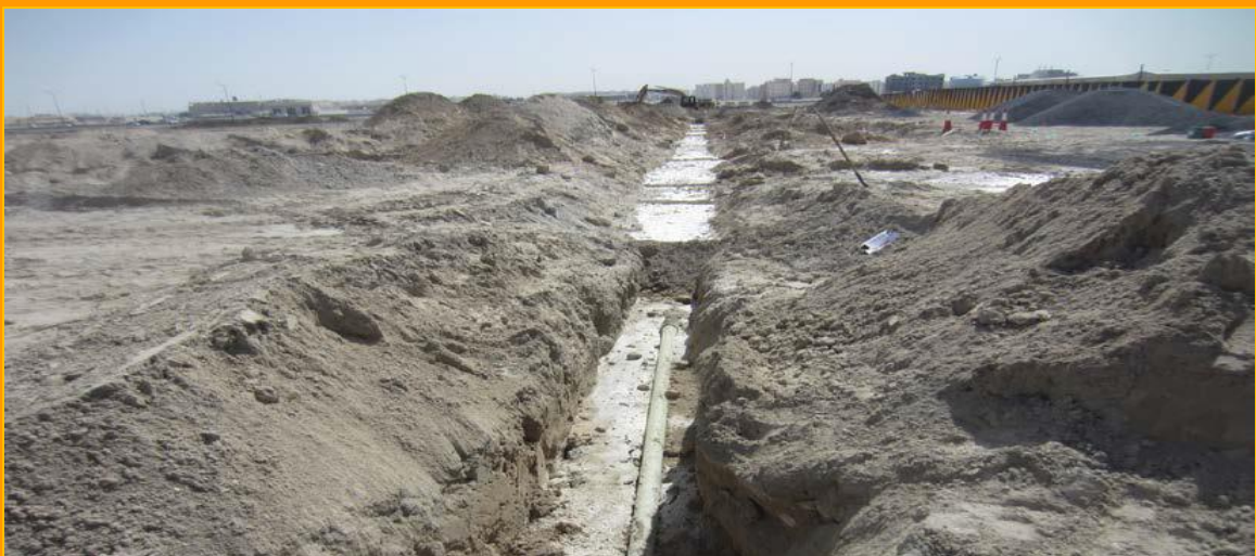
Portable Water Works